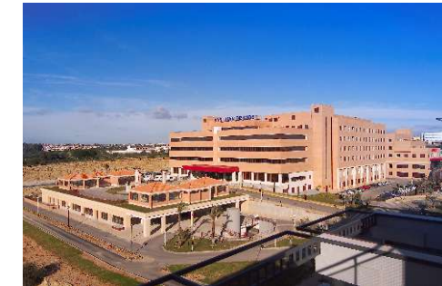
HOSPITAL, BORMUJOS, SEVILLA SOLAR ENERGY