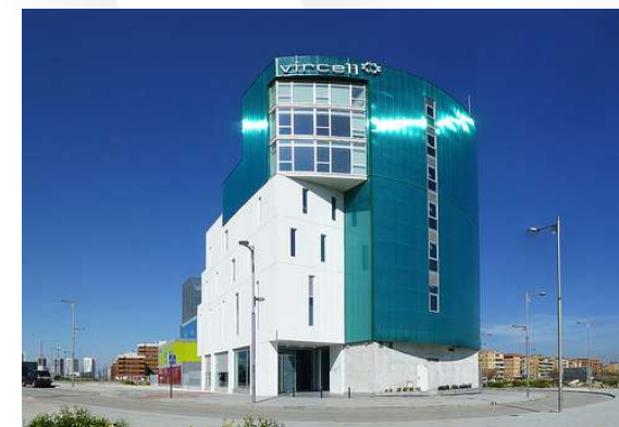
LABORATORY VIRCELL, (GRANADA) MPE - HVAC

IN THE AIR CONDITIONING SYSTEMS FOR LABORATORIES, IT MUST BE ENSURE THAT THE CONTAMINATION TIGHT LIMITST OF AIR WITH MICRO-ORGANISMS NOT EXCEEDED THE MINIMUM STANDARDS ESTABLISHED BY.