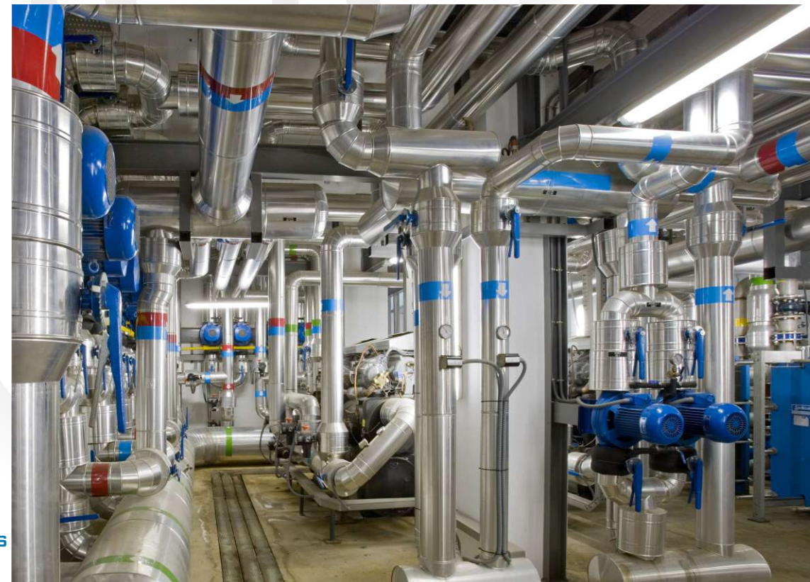
ANDALUSSIAN PARLIAMENT (SEVILLE) ENGINE ROOM - HVAC SYSTEM APPLYING GEOTHERMAL TECHNOLOGY

WE STRIVE FOR EXCELLENCE IN OUR FIELD, SO AS TO MAINTAIN AND ENHANCE OUR MARKET SHARE, TO INCREASE THE LIFE SPAN OF THEIR INSTALLATIONS TO SUGGEST UPGRADES AND BRING OUT OPERATIONAL EFFICIENCY.