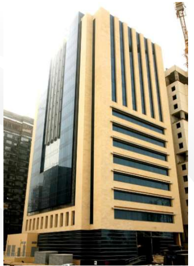
TOURIST APARTMENTS OLD SALATA.