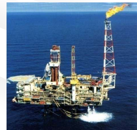
PROJECTS INDUSTRIAL SERVICES

IN THE INDUSTRIES IT IS IMPORTANT TO PAY ATTENTION FOR OPTIMIZATION OF PRODUCTION COST. FOR IT WE CARRY OUT AN ENERGY AUDIT, IN ORDER TO CHOOSE THE BEST ENERGY SOURCE SYSTEM, AND AT THE SAME TIME ACHIEVE A PRODUCTION TO A LOWER COSTS.