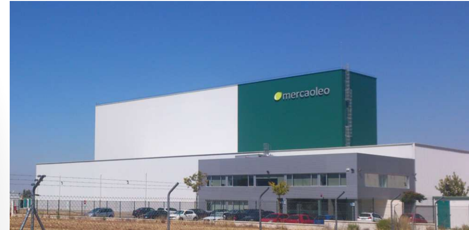
OLIVE OIL FACTORY, ANTEQUERA (MALAGA) HVAC