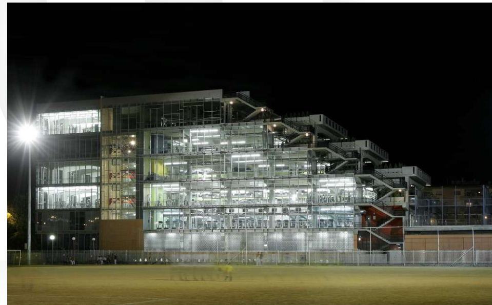
SPORTS CENTRE, SEVILLE HVAC 1000Kw - SOLAR COLLECTOR 300 M 2