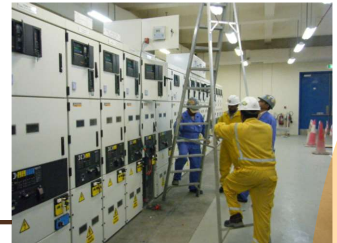
SUPPORT SERVICES AREA, LAFFAN

WE STRIVE FOR EXCELLENCE IN OUR FIELD, SO AS TO MAINTAIN AND ENHANCE OUR MARKET SHARE, TO INCREASE THE LIFE SPAN OF THEIR INSTALLATIONS TO SUGGEST UPGRADES AND BRING OUT OPERATIONAL EFFICIENCY.