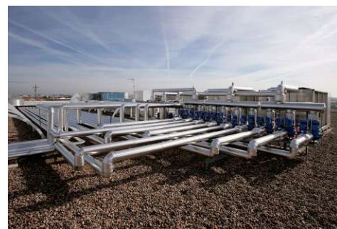
TRAGSA'S HEADQUARTERS INSTALLATIONS DETAIL