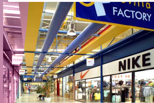
MALL CENTER FACTORY, (SEVILLE) HVAC ABSORPTION PLANT