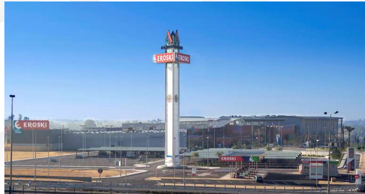
MALL CENTER LOS ALCORES, (SEVILLE) MEP - FIRE FIGHTING & EXT.

THE REQUIREMENTS IN THE FACILITIES FOR FIRE AND SMOKE PROTECTION IN THE CONSTRUCTION OF MALL CENTER ARE VERY STRICT, BEING FOR IT NECESSARY A CFPA CERTIFICATION COMPANY.