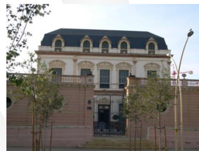
MERMAID PALACE, (SEVILLE) HVAC · GEOTHERMAL ENERGY

IN THE MUSEUMS, THE PRIMARY AIM IS PRESERVATION OF PRICELESS WORKS OF THE ART. IT MUST BE CONTROLLED AT PERFECT AIR PARAMETERS, TEMPERATURE, RELATIVE HUMIDITY, AND AIR MOVEMENT, KEEPING IT AT CONSTANT LEVEL.