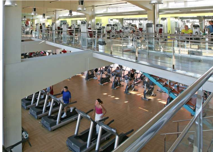
BIGGEST INDOOR MULTIFUNCTIONAL SPORTS CENTER IN EUROPE MEP - SOLAR COLLECTOR

WE BENEFIT FROM A SPECIFIC DIVISION FOR THE DESIGN, EXECUTION AND MAINTENANCE OF SPORTS CENTERS.