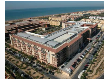
HOTEL ISLANTILLA, HUELVA MEP FIRE FIGHTING