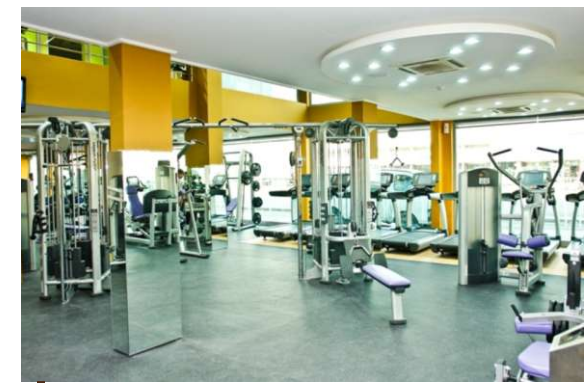
SPORT CENTER QATAR