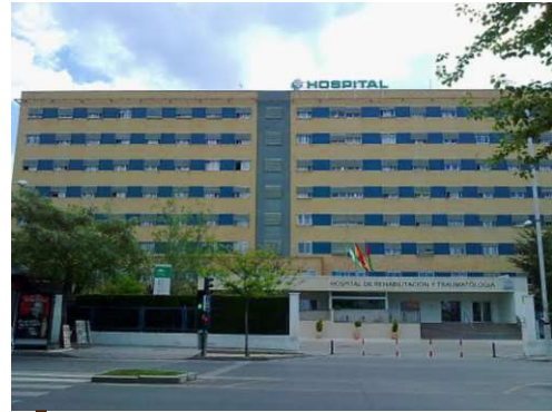
HOSPITAL, (GRANADA) HVAC - ABSORTION PLANTS