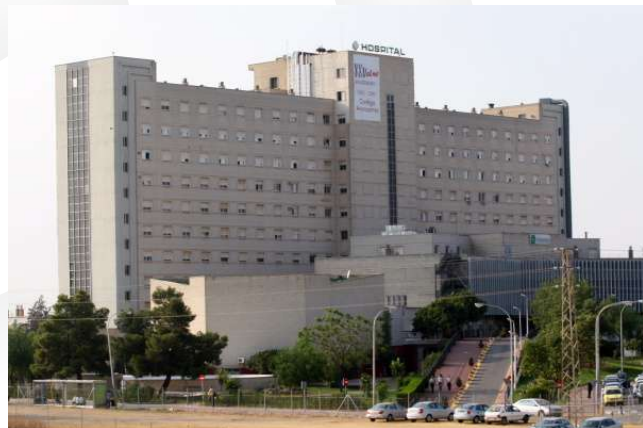
HOSPITAL V. DEL VALME, SEVILLE MEP

IN THE HOSPITALS, THE AIR CONDITIONING FOR AREAS SUCH AS INTENSIVE CARE UNITS, INSULATING ROOMS AND STERILE CARE ROOMS MUST FULFIL SPECIAL REQUERIMENTS. THE OUTSIDE WORLD MUST KEPT OUT SIDE, BY MEANS OF THE DIFFERENTS PRESSURE LEVELS (POSITIVE OR NEGATIVE), AIRLOCKS, AND EFFECTIVE FILTRATION OF THE SUPPLY AND EXTRACT AIR.