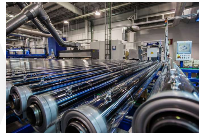
FACTORY FOR SOLAR COLLECTOR, (SEVILLE) HVAC