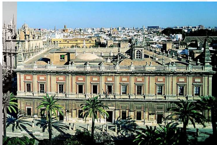
ARCHIVE AND MUSEUM OF THE AMERICAN CONTINENT DISCOVERY HVAC · MEP · FIRE FIGHTING · CONTROL AND PLC SYSTEM