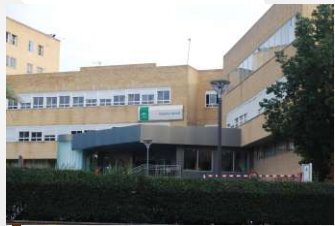
HOSPITAL V. DEL ROCÍO, (SEVILLE) HVAC