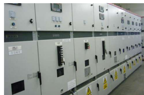
PERMANENT POWER SUPPLY TO QATAR GAS CAMP AND SSA, RAS LAFFAN

WE BENEFIT FROM A GREAT TECHNICAL STAFF WITH MORE THAN 600 HIGHLY SKILLED INDIVIDUAL WITH STRONG BACKGROUND ON SAFETY, QUALITY AND ENVIRONMENTAL AWARENESS AND TRAINING.