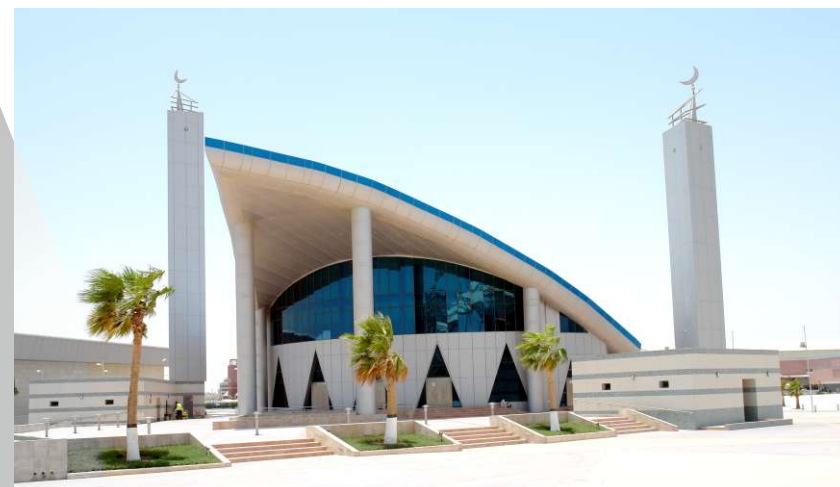
Mosque, (SPORT CITY)

IN THE MUSEUMS, THE PRIMARY AIM IS PRESERVATION OF PRICELESS WORKS OF THE ART. IT MUST BE CONTROLLED AT PERFECT AIR PARAMETERS, TEMPERATURE, RELATIVE HUMIDITY, AND AIR MOVEMENT, KEEPING IT AT CONSTANT LEVEL.