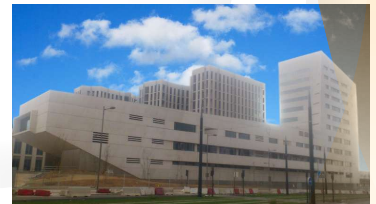
FACULTY OF SCIENCE FOR THE HEALTH, GRANADA MEP FACILITES & FIRE FIGTHING AND EXT SYSTEM

HOSPITALS HOTELS SHOPPING MALLS OFFICE BUILDINGS RESORTS INDUSTRIES PUBLIC INSTITUTIONS SPORT CENTERS ELDERLY HOSPITALS