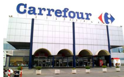
MALL CENTER CARREFOUR, (SEVILLE) HVAC