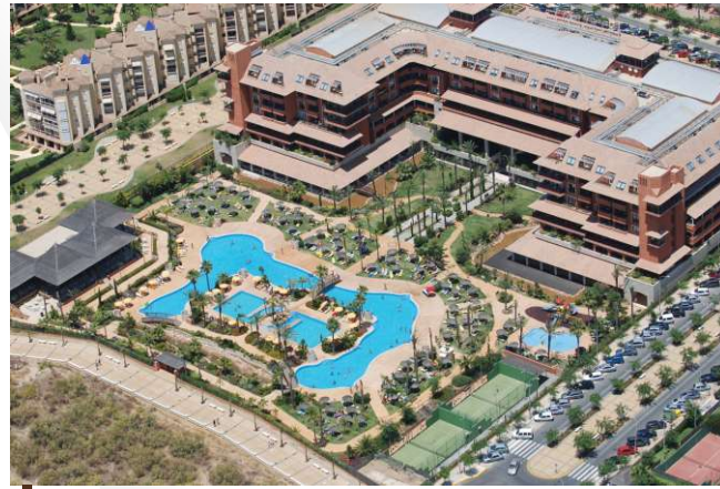
GRAN HOTEL ISLANTILLA, (HUELVA) MEP - HVAC, FIRE FIGHTING & EXT.

IN THE FACILITIES FIELD FOR HOSPITALS AND HOTELS, WE ACT AS MEP CONTRACTOR INCLUDING THE COMMISSIONING AS WELL AS THE TESTING, ADJUSTING AND BALANCING (TAB). FOR THIS PURPOSE, WE RELY ON A TEAM OF PROFESSIONALS WITH AN WIDE BACKGROUND.