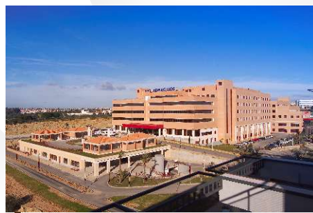
HOSPITAL S. JUAN DE DIOS, (SEVILLE) HVAC & SOLAR COLLECTOR 300M 2