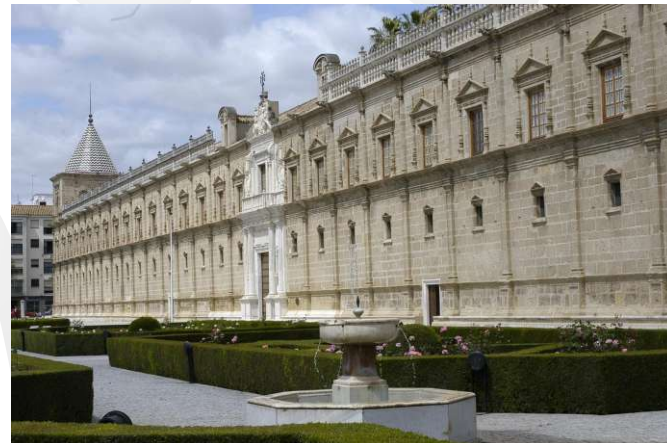
ANDALUSIAN PARLIAMENT, (SEVILLE) HVAC · FIRE FIGHTING · GEOTHERMAL SYSTEM