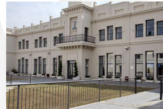
FACULTY OF LAW (SEVILLE) HVAC & FIRE FIGHTING