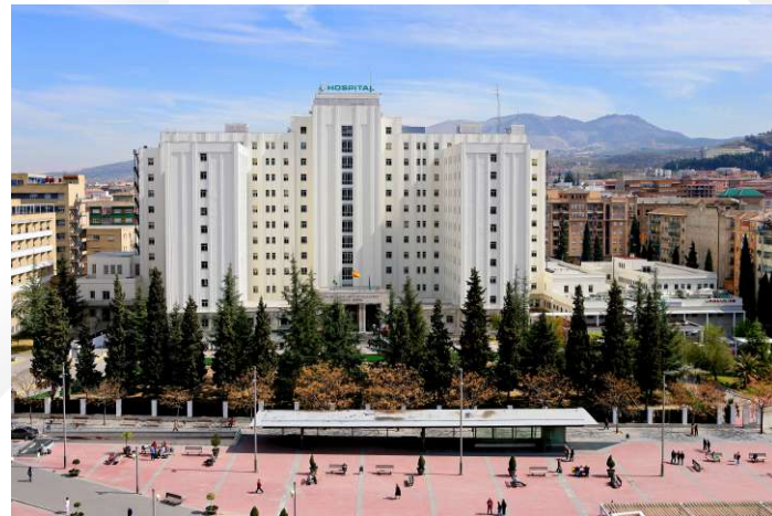
HOSPITAL V. DE LAS NIEVES, (GRANADA) TRIGENERATION SYSTEM & HVAC CONTROL PLC, MEP.