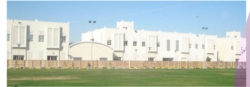
ENGLISH MODERN SCHOOL