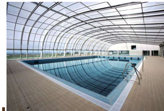
INDOOR SWIMMING POOL, CARMONA, SEVILLE