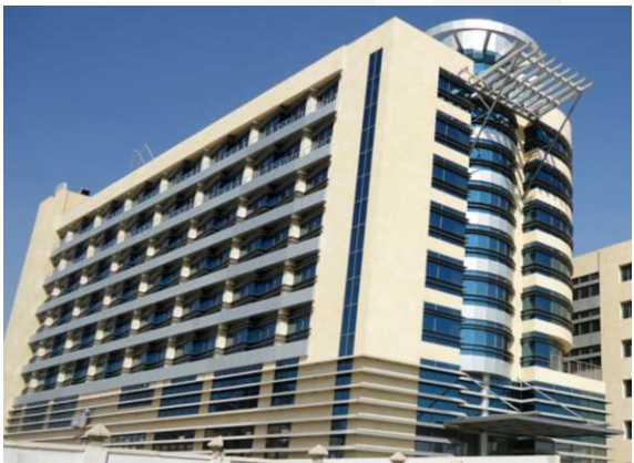
HOTEL BUILDING IN FEREEJ BIN MOHAMOUD.