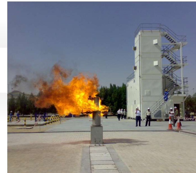
QATAR LOCAL FIRE TRAINING

WE BENEFIT FROM A GREAT TECHNICAL STAFF WITH MORE THAN 600 HIGHLY SKILLED INDIVIDUAL WITH STRONG BACKGROUND ON SAFETY, QUALITY AND ENVIRONMENTAL AWARENESS AND TRAINING.