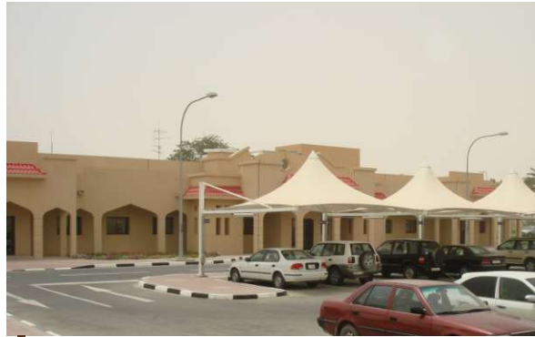
MEDICAL CENTER DUKHAN (DOHA)

IN THE HOSPITALS, THE AIR CONDITIONING FOR AREAS SUCH AS INTENSIVE CARE UNITS, INSULATING ROOMS AND STERILE CARE ROOMS MUST FULFIL SPECIAL REQUERIMENTS. THE OUTSIDE WORLD MUST KEPT OUT SIDE, BY MEANS OF THE DIFFERENTS PRESSURE LEVELS (POSITIVE OR NEGATIVE), AIRLOCKS, AND EFFECTIVE FILTRATION OF THE SUPPLY AND EXTRACT AIR.