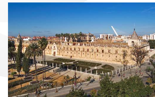
PARLIAMENT OF ANDALUSIA, SEVILLE HVAC FACILITIES & GEOTHERMAL ENERGY