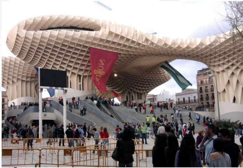
COMMERCIAL AND BUSINESS CENTER METROPOL - PARASOL, (SEVILLE) MEP - FIRE FIGHTING & EXT.