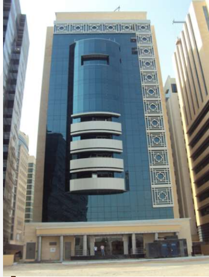
OFFICE BUILDING OLD SALATA.