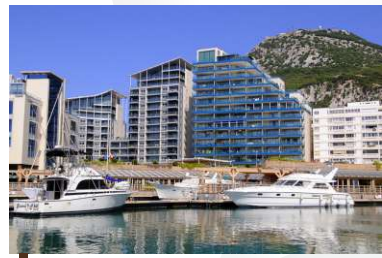
BUSINESS CENTER OCEAN VILLAGE, GIBRALTAR MEP - HVAC, FIRE FIGHTING & EXT.