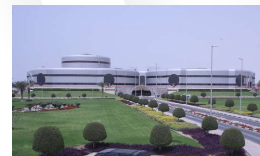
QP HEAD QUARTERS BUILDING AT DHUKAN