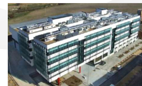
HIGH COUNCIL FOR SCIENTIFICS RESEARCH (CSIC), (SEVILLE) HVAC - MEP - FIRE FIGHTING