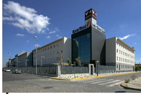
HOTEL VÉRTICE, BORMUJOS, (SEVILLE) MEP - HVAC, FIRE FIGHTING & EXT.