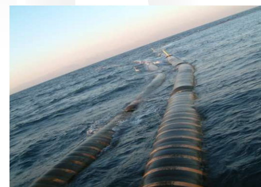
PROJECTS INDUSTRIAL SERVICES

IN THE INDUSTRIES IT IS IMPORTANT TO PAY ATTENTION FOR OPTIMIZATION OF PRODUCTION COST. FOR IT WE CARRY OUT AN ENERGY AUDIT, IN ORDER TO CHOOSE THE BEST ENERGY SOURCE SYSTEM, AND AT THE SAME TIME ACHIEVE A PRODUCTION TO A LOWER COSTS.