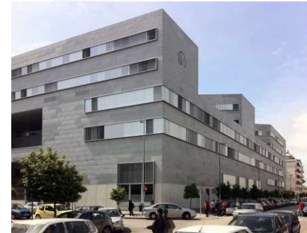
UNIVERSITY SEVILLE HVAC - FIRE FIGHTING & EXT