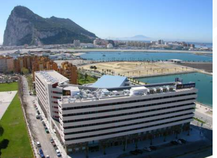
HOTEL IBEROSTAR AND EXHIBITION CENTER, LA LÍNEA, (CÁDIZ) MEP - HVAC, FIRE FIGHTING & EXT.